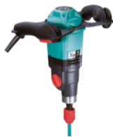
Fig.1: Mixing drill