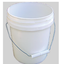
Fig.3: Empty bucket