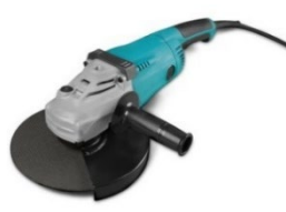
Fig.5: Hand-held grinder